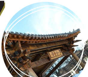
Lehigh-Bethlehem Harmony Pavilion

South Bethlehem Greenway Between Webster & Taylor Street