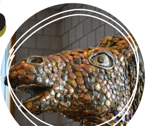
Alferd the Mountain Mule