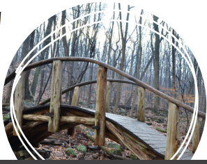
The Chinese Bridge