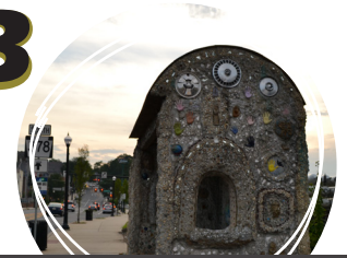
Mr. Imagination Bus Shelter