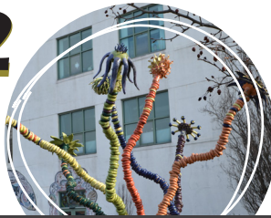
A Joyful Noise