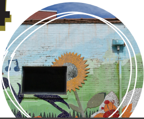
CAB Mural Project